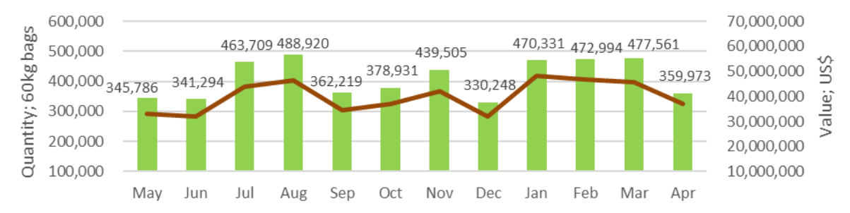
Quantity Table1: Comparison of Coffee Exports of April 2018/19 and 2019/20 Coffee Years