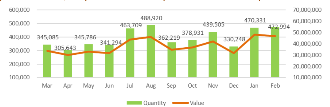
Table1: Comparison of Coffee Exports of February 2018/19 and 2019/20 Coffee Years