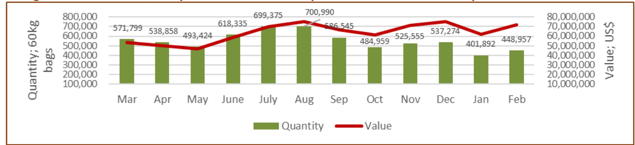
Fig 1: Trend of Total Quantity and Value of Coffee Exported: March 2021- February 2022

Table1: Comparison of Coffee Exports of February 2020/21 and 2021/22 Coffee Years