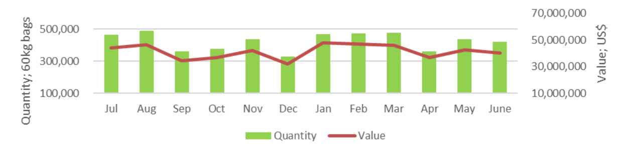
Table1: Comparison of Coffee Exports of June 2018/19 and 2019/20 Coffee Years