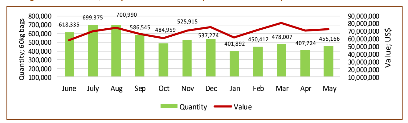
Table1: Comparison of Coffee Exports of May 2020/21 and 2021/22 Coffee Years