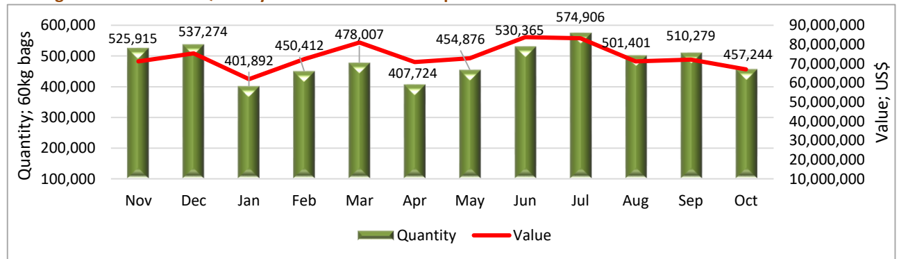
Table1: Comparison of Coffee Exports of October 2021/22 and 2022/23 Coffee Years